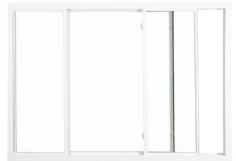
3-Lite Sliding Window