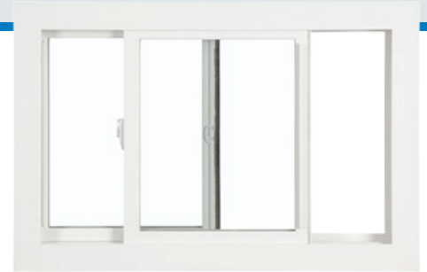
2-Lite Sliding Window