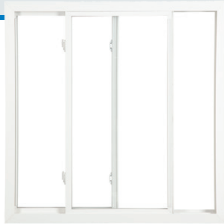
2-Lite Sliding Window