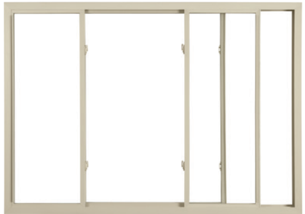
3-Lite Sliding Window