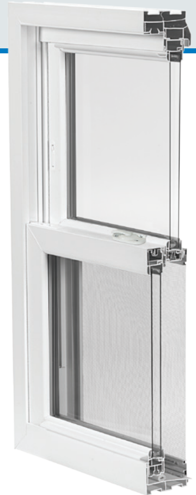
Featuring our new low profile lock.