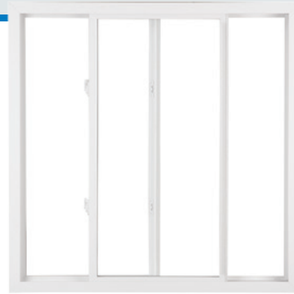
2-Lite Sliding Window