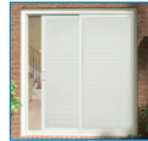
Sealed between the glass, the blinds control light and privacy.