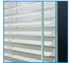
Blinds between glass never need dusting and are safe for pets and children!