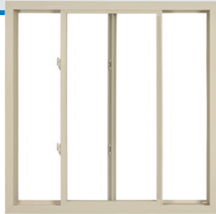
2-Lite Sliding Window