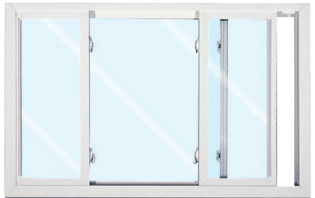
3-Lite Sliding Window