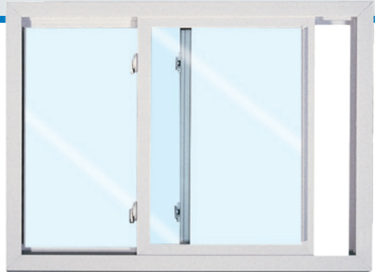
2-Lite Sliding Window