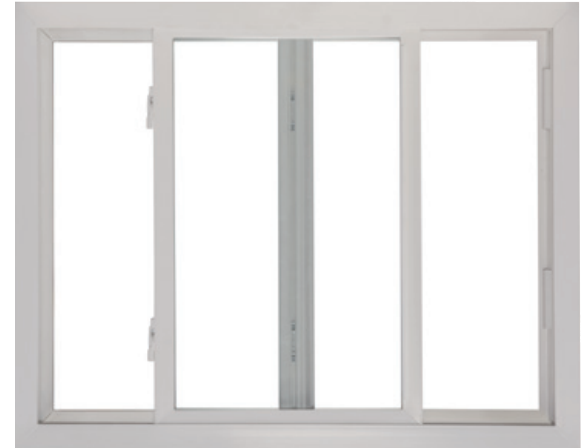
2-lite sliding window with front flange.