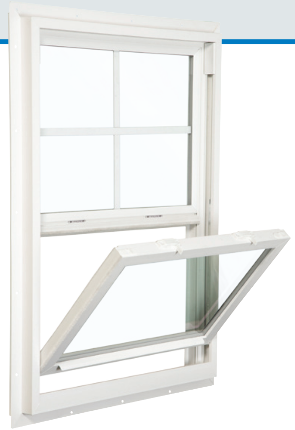
Step Bevel Design creates a beautiful exterior appearance